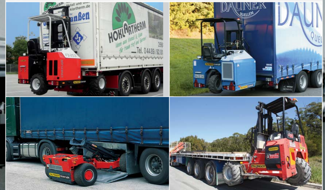
The ideal companion. CRAYLER transportable forklifts fit on all standard trucks, trailers, and semis, as well as on existing forklift mounting brackets.

Whether mounted on the back of a carrier vehicle or in a protective box between the axles, they accompany truck drivers wherever forklifts with mobile power are needed. Fast, dependable and always on the cutting edge of technology.